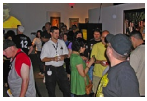
Fans and Exhibit in the McGuinn Gallery

However, not one mention was made by the media about our "Pittsburgh Sports in Art" exhibit even with our artwork splashed all over their reporting of the event. In preparation I wrote a press release, had informational exhibit signage and was there for the duration hanging around the media people and dropping hints but there was no interest in my story of our exhibit. In contrast, the sports fans loved us as they ferociously grabbed up our samples and the news media ate up the scene. So what is wrong with this picture (no pun intended)?