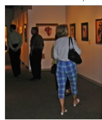
Fans and Exhibit in the McGuinn Gallerv

And there was the news media, shooting our artwork with the footage and photos shown on all local TV sports news pro-